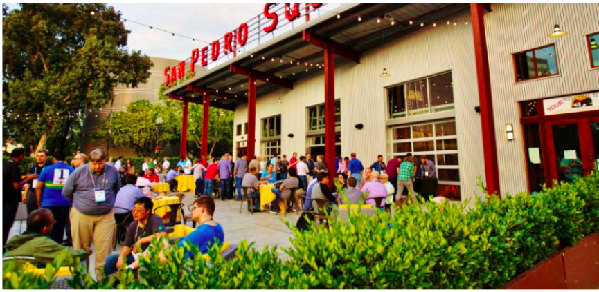
Choose from dozens of food stalls at the popular San Pedro Square Market in downtown San Jose.