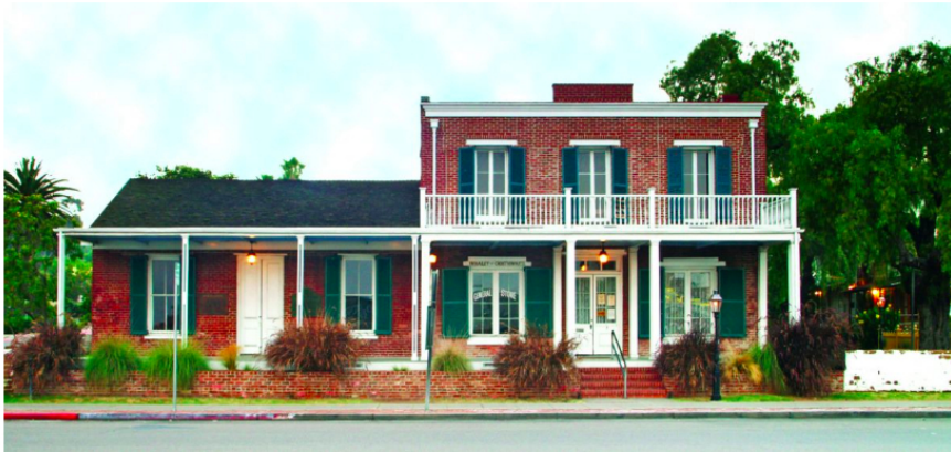
Take a tour of the the Whaley House In San Diego and decide for yourself if there's something haunted going on there.

A young woman committed suicide at the Hotel del Coronado in 1892, and it's been rumored that she's haunted the hotel ever since. Paranormal researchers have found a spectral presence in her room, guests have heard inexplicable voices, and hotel employees have witnessed items in the gift shop falling off shelves yet remaining completely intact. The guest room in which she died is the most requested by visitors in the hotel.