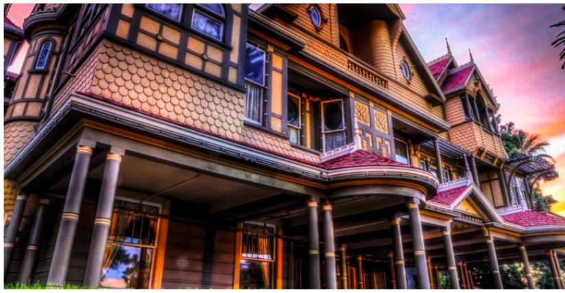
The Winchester Mystery House In San Jose is rumored to be haunted.